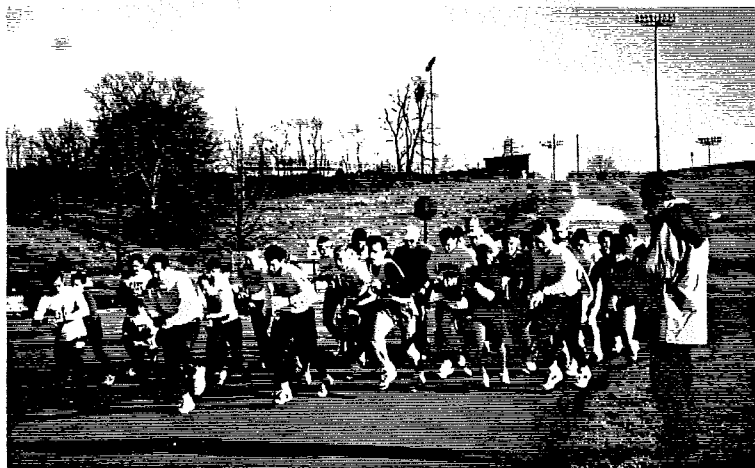
The 36 runners take off at the start of the 5-K Nut Race on Feb. 5 on a sunny, 30-degree day at Reactor Park.

Masters nationals CTC 25 years ago Point standings